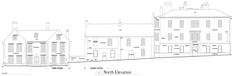
1 4 North Elevation

THIS COPY HAS BEEN MADE BY OR WITH THE AUTHORITY OF HER MAJESTY'S ARCHITECTURAL RECORDS PURSUANT TO THE TERMS OF THE COPYRIGHT ACT 1911 AND THE TERMS OF THE ACT PROVIDED A FULL STATEMENT OF THE AUTHOR'S NAME. THIS COPY SHOULD NOT BE REPRODUCED WITHOUT THE WRITTEN PERMISSION OF THE COPYRIGHT OWNER.