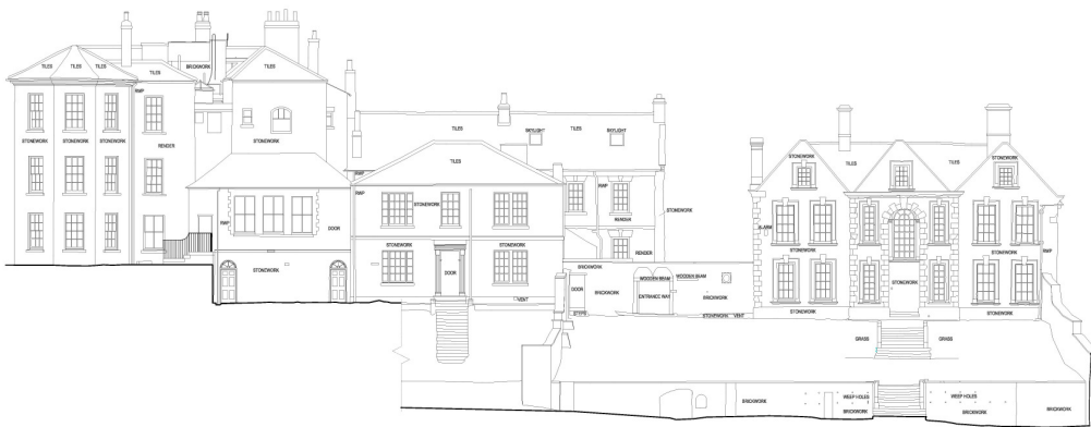
3 4 South Elevation